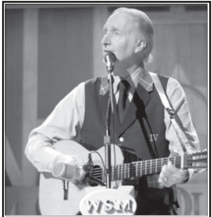
George Hamilton IV comes directly from the Grand Ole Opry to the 2010 Miles of Memories MusicFest.

George IV will be with us all weekend, doing a special concert each evening, joining other MusicFest performers for theme shows and chatting with fans.